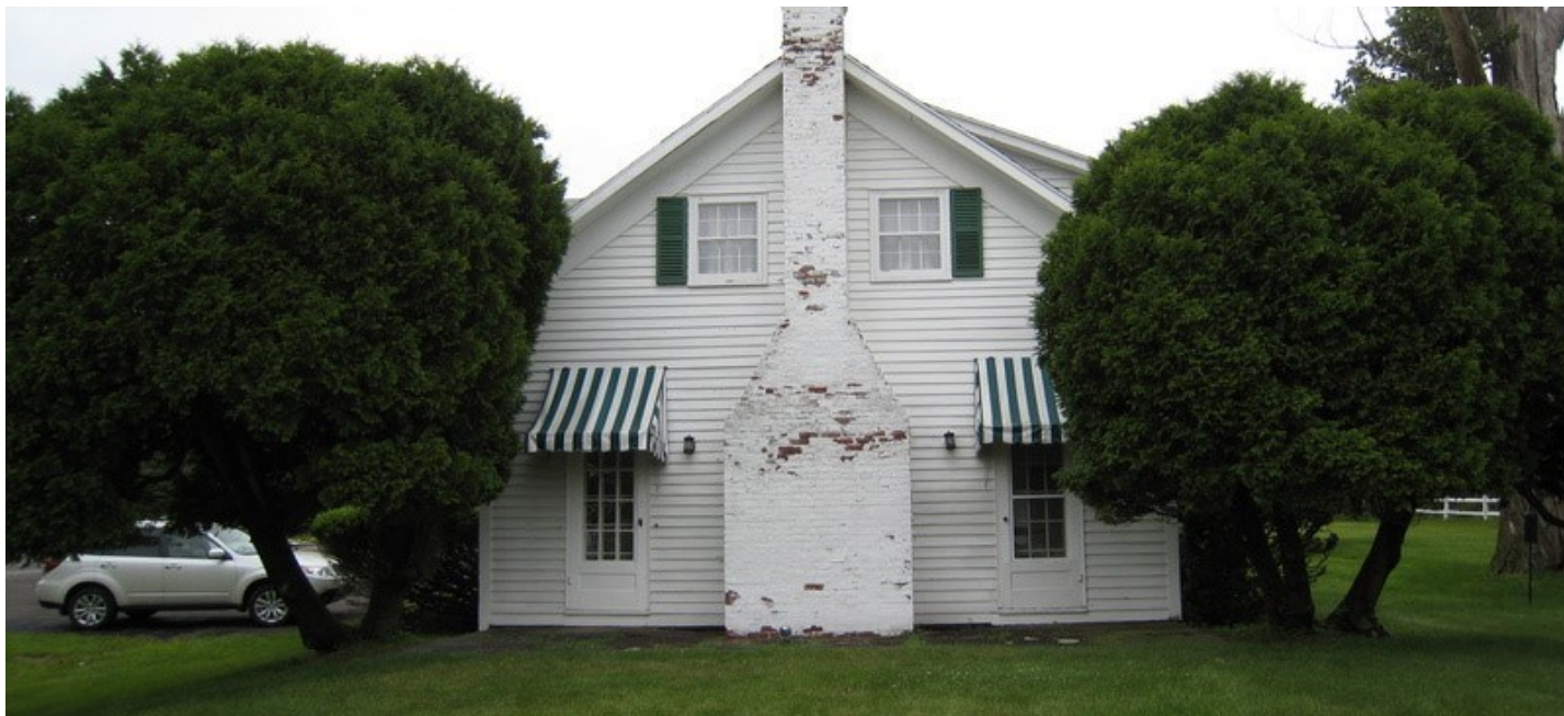
The old Kline schoolhouse between Hanshaw and Pleasant Grove Roads (now a dental office).

The need to build sidewalks on these two old connecting roads in order to make a safe pedestrian route for Cayuga Heights children is rooted in the history of the Ithaca schools village children attend. Ithaca High School moved from the middle of downtown to its current location between the Cayuga Street extension and Lake Street in 1959, and what was then Boynton Junior High School opened just north of the high school in September 1971. Cayuga Heights children have attended what soon became Boynton Middle School ever since, except for a period between 1980 and 1988 when Cayuga Heights Elementary School was closed because of declining enrollment. During that time they were bused to Northeast Elementary and DeWitt Middle School on Warren