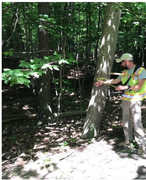
Tree inventory being taken in the Village during May 2019.

Masonry and stone gateposts and walls with inset seats were included in the original vision of the park and constructed shortly after the park was established. An additional stone bench and slab sculpture were donated and placed in the park in 1998.